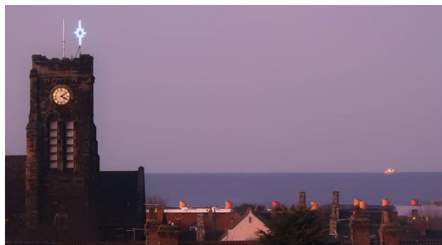
Image of Marske Belltower with Christmas Star