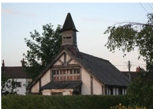
The 'Tin Tabernacle' St Oswald's Church, Dunsdale.

A Bell, retrieved from the disused Miners' Church at Dunsdale, was shipped to New Zealand where it was installed in the Healing Centre at Titoki, Whakatane on Bay of Plenty.