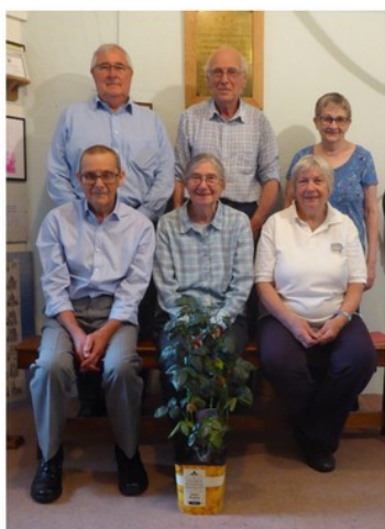
band clockwise from front right